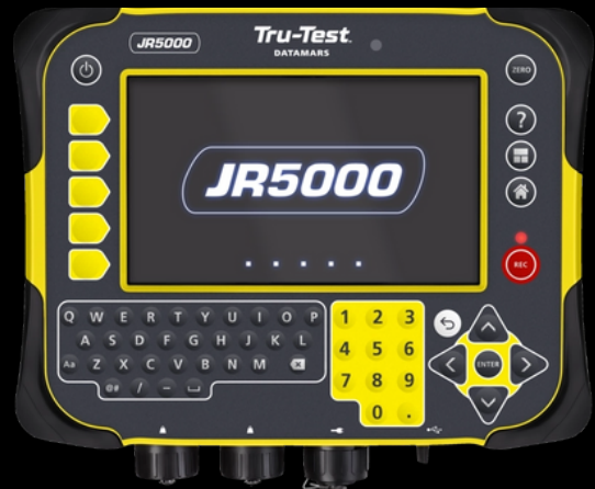
JR5000 Display Indicator FETF78

Captures accurate live animal weights and displays live weight gain since the previous session.