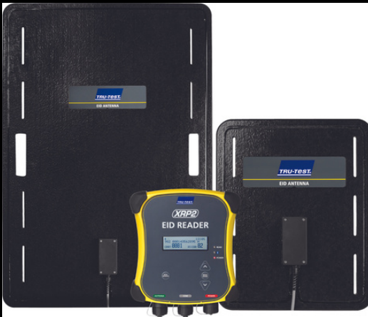
Cattle/ Sheep EID Panel Reader FETF68/74

The XRP2 is built around Tru-Test's state of the art digital signal processing that gives optimum read range while automatically reducing unwanted interference.