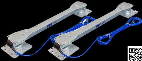
Eziweigh HDT5 Loadbars FETF79SH/CA

Tru-Test load bars are recognised for their rugged durability and performance in harsh environments.