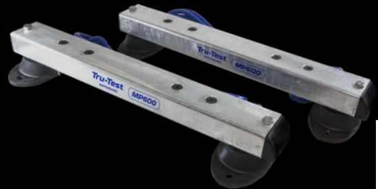
MP 600 Loadbars FETF80SH/CA

Designed for use in a variety of single-animal portable applications, including alleyway platforms, cages or small animal crates.