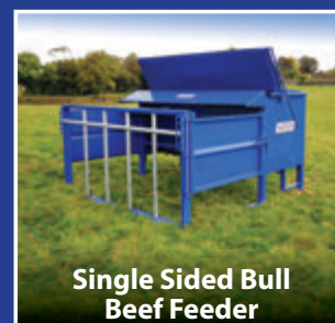
Single Sided Bull Beef Feeder