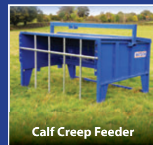
Calf Creep Feeder