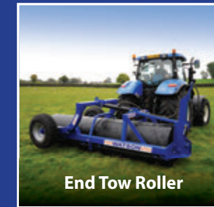
End Tow Roller