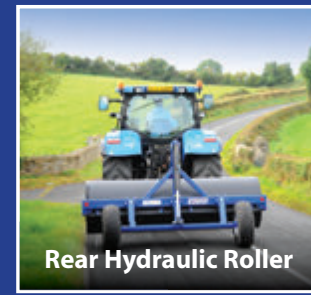
Rear Hydraulic Roller