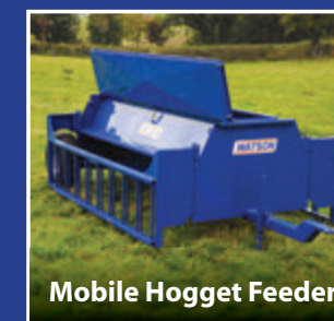
Mobile Hogget Feeder