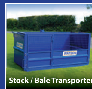
Stock / Bale Transporter