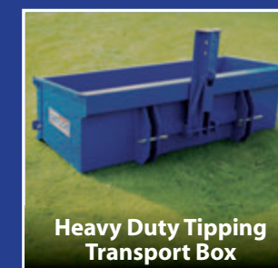
Heavy Duty Tipping Transport Box