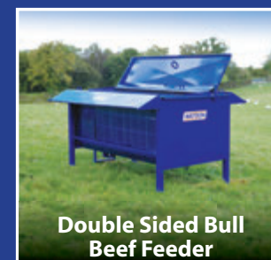
Double Sided Bull Beef Feeder