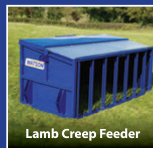
Lamb Creep Feeder