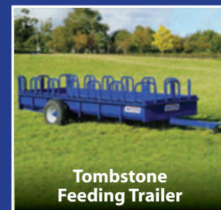
Tombstone Feeding Trailer