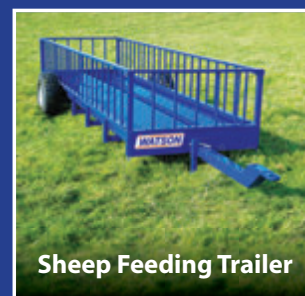
Sheep Feeding Trailer