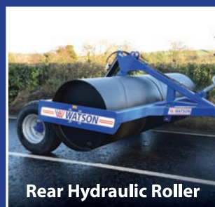
Rear Hydraulic Roller