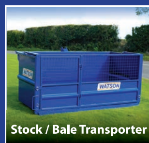
Stock / Bale Transporter