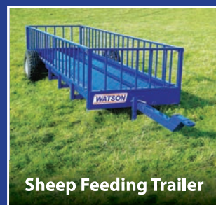
Sheep Feeding Trailer