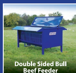
Double Sided Bull Beef Feeder