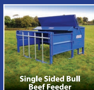
Single Sided Bull Beef Feeder