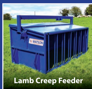
Lamb Creep Feeder