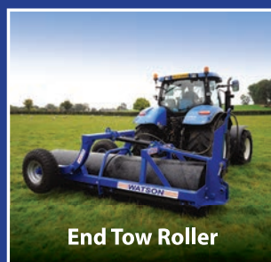
End Tow Roller