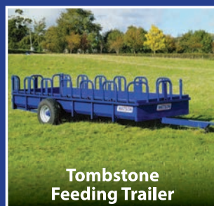
Tombstone Feeding Trailer