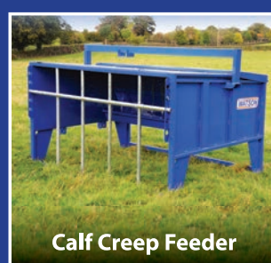
Calf Creep Feeder