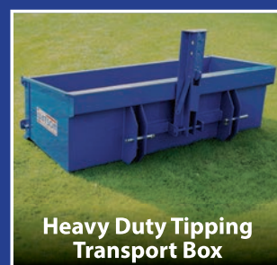
Heavy Duty Tipping Transport Box