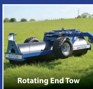
Rotating End Tow