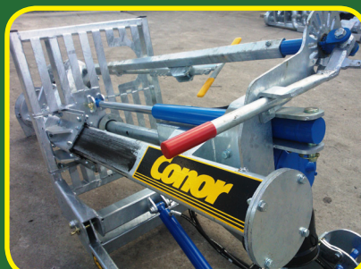
Heavy duty robust construction