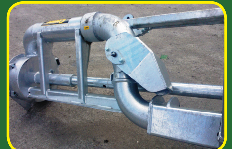
Unique easy to use top fill design