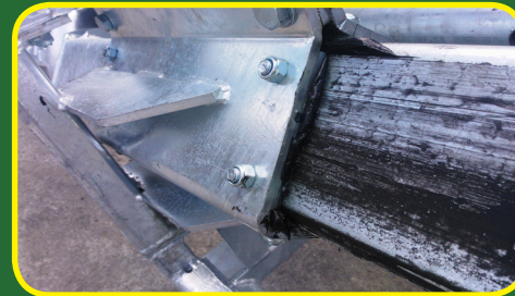
Poly side plates