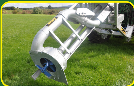
Large propeller with straw chopper