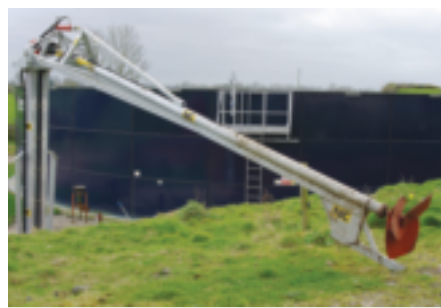
Over the Top Mixers