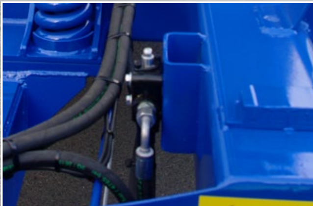
Hydraulic Tipping Safety Switch