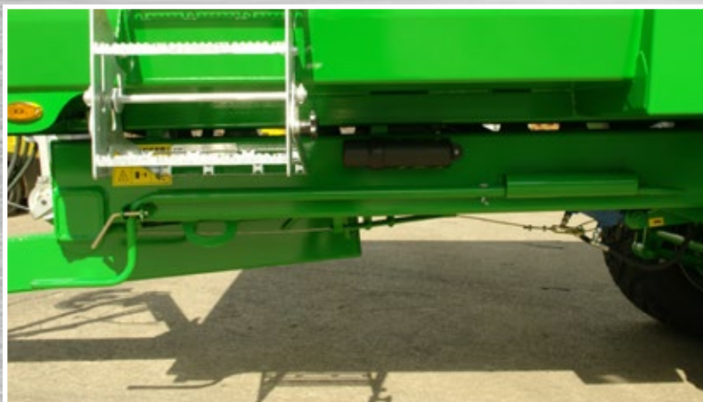
Storage for Weather Cover Winding Handle