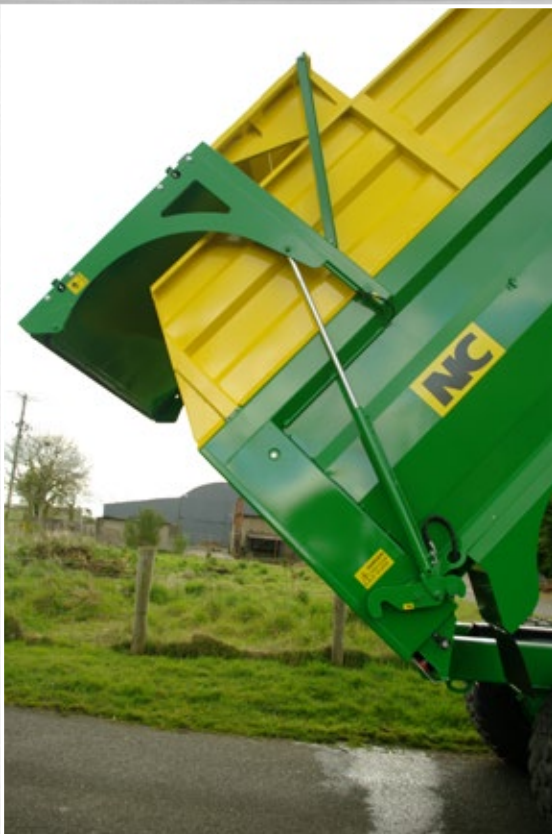
Rear Door Hydraulic Locking Mechanism