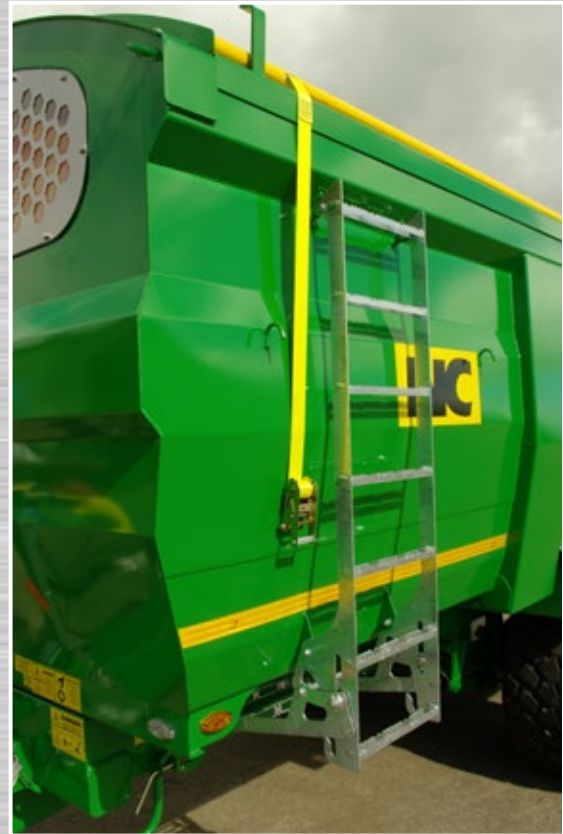
Access Ladder in Transport Position