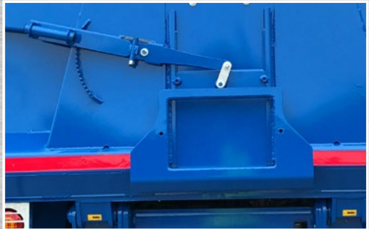
Multi Position Grain Chute