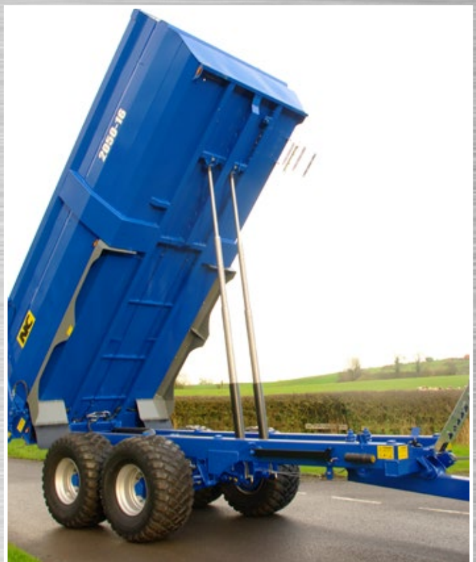
Twin Hydraulic Rams