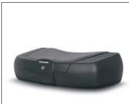
ATV 40 LITER CASE (FRONT)