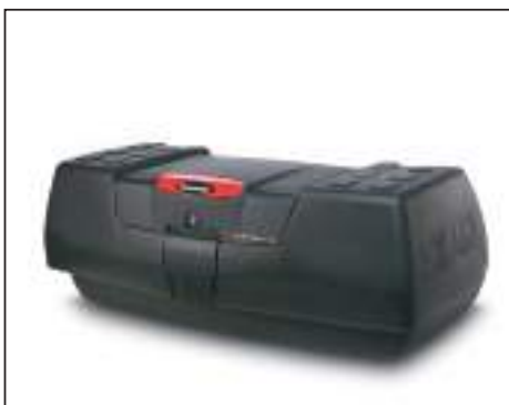
ATV 110 LITER CASE (REAR)