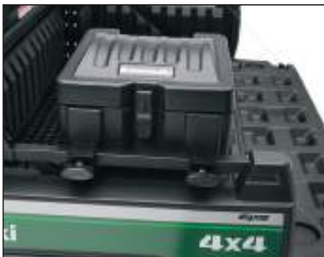
QCR™ CARGO BOX