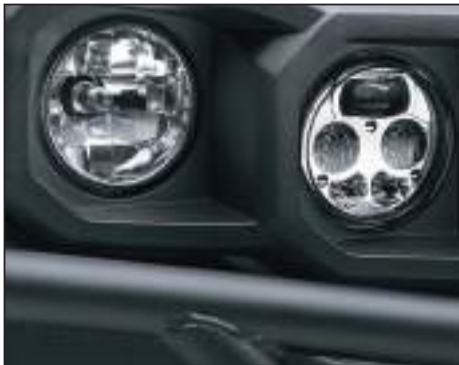
LED HEADLIGHT SET