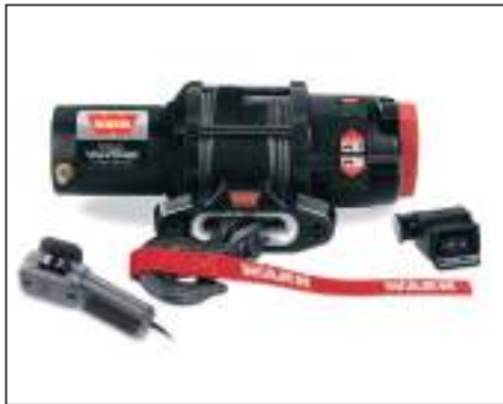
WARN® PROVANTAGE™ 3500S WINCH