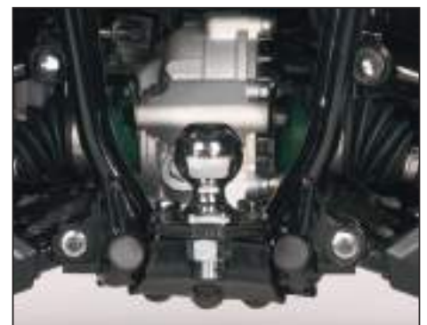
TOW BALL (50MM)