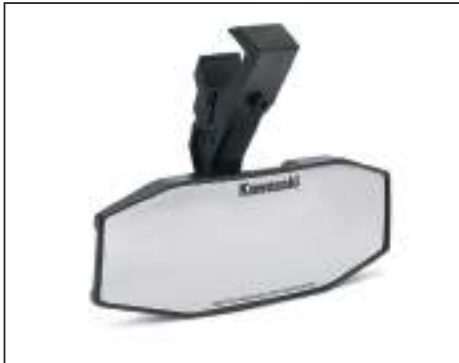
SIDE MIRROR SET